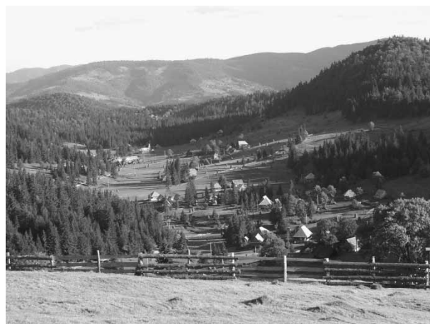
Fig. 8. The typical semi-open farmland-forest mosaic of the Apuseni Mountains.

As stated previously, there are many facets to landscape management and there are various ways in which they can be accommodated. However, there is one junction to which many roads lead: the bottom-up approach, the involvement of stakeholders in landscape management. Landscape is a public good on which numerous people stake claims. This fact implies that the concepts, which ought later to be accepted, should be developed in a participatory approach. Pivotal stakeholders are in most cases politicians and decision-makers from different levels, public agencies, NGOs, but most importantly the people inhabiting the landscape. Whereas the initiation of participatory processes is almost standard practice in landscape planning in western Europe, bottom-up approaches are often rare in Eastern Europe. This fact prompted our institute to launch the 'Proiect Apuseni' (Apuseni Project) conducted in the Apuseni Mountains in north-western Romania (Fig. 8). It analysed the methods and the organisation of participatory