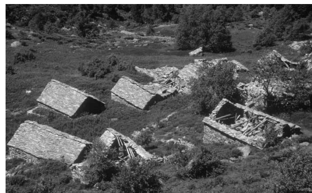
Fig. 2. Abandoned Alpine huts and pastures in the Val Grande National Park on the Alpe Serena.