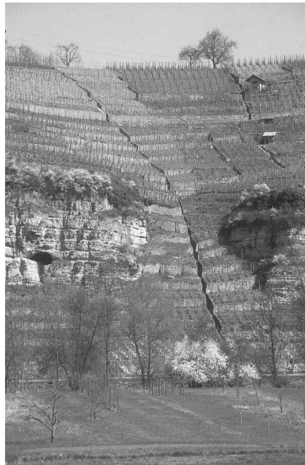
Fig. 5. The centuries-old, richly structured vineyards of Vaihingen-Roßwag.

The research project focuses on the genesis of the selected vineyards, their stylistic differences, the construction techniques applied, the quality of landscape elements, the local perception of the landscapes, and the development of future conservation strategies through the combined efforts of winegrowers, and nature and heritage conservation bodies. The project is composed of six successive working steps: