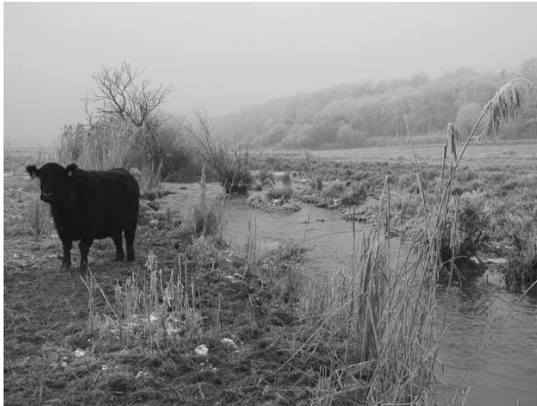
Fig. 6. Grazing Galloway cattle on the bank of the restored River Syr in Luxembourg.

(Fig. 6). In particular, the effectiveness of ungulate grazing to restore diversity in wetland vegetation and the determination of an appropriate range management in this context is highly debated (Gander et al. 2003; Isselstein et al. 2005). Moreover, there is a plea for more 'cultural sustainability' in restoration activities by integrating land use history and a stakeholder's attitude analysis in research and planning for better success of such projects in the long run (Nassauer 2004). The Floodplain Restoration Project was thus initiated to provide an interdisciplinary evaluation and to determine the nature conservation potential of the measures implemented for the restoration of the biodiversity and functionality of other Central European floodplains (Schaich & Konold 2006).