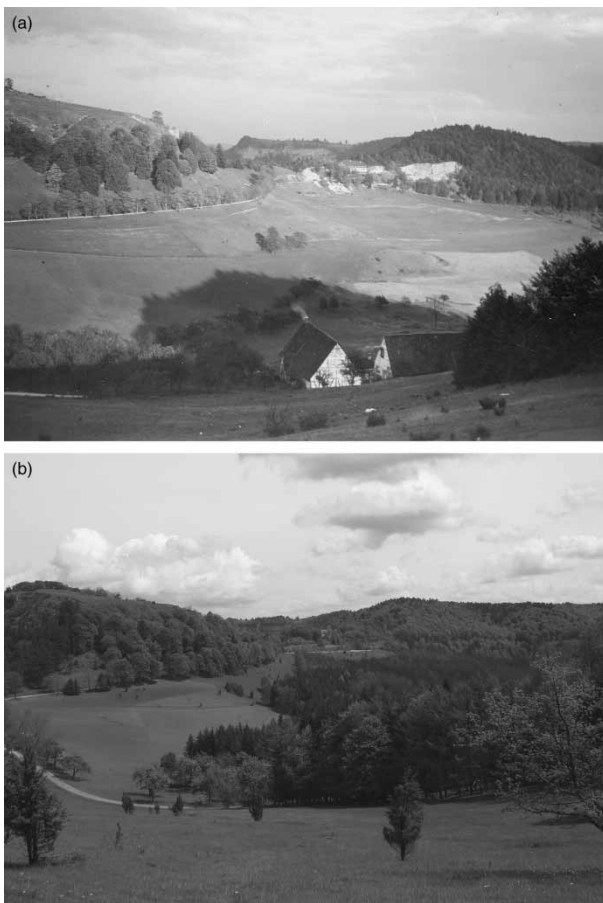
Fig. 4. Landscape change in south-west Germany induced by the expanding forest area. a) The first photograph was taken in 1938. b) The second photograph shows the same view in 2005.

The main objective of this transdisciplinary project is to produce results with practical relevance. This can only be achieved if the results include a recognition of the circumstances and the needs of the local people, especially those of the farmers who more than anyone else shape the landscape. The knowledge and perspectives of the stakeholders will be incorporated into the project at all stages. This involves, for example, constant consulting with representatives of the relevant interest groups, as well as events held 'on site' in the research communities, such as stakeholder meetings, group