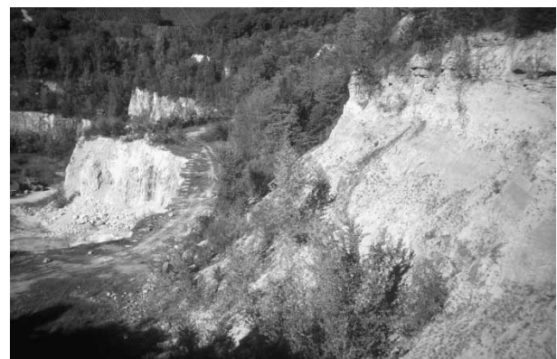
Fig. 7. View of an abandoned quarry, with rock faces, boulders, gravel heaps, and other dry and oligotrophic sites.

In Germany reclamation is legally required for all former mining areas and landfills. Until a few years ago, the focal point was set on the restitution of the 'old' conditions: creating useable areas and restoring the natural scenery. Where forest was originally cleared recultivation should again result in woodland. In the meantime there has been a reappraisal of the approach to leave more room for natural processes, for example, unhindered natural succession. Former quarries (Fig. 7), gravel pits and sand pits, where mining activities created locations valuable for nature protection (e.g. steep rock faces, boulder slopes, dry and nutrient-poor gravel/sand heaps, stockpiles, oligotrophic water bodies of different sizes and permanence) are well suited to this strategy.