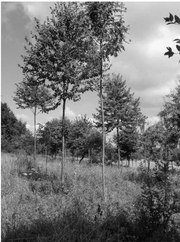
Fig. 3. Ten year old deciduous trees on an experimental agroforestry plot near Bopfingen in eastern Baden-Württemberg.

From a landscape management perspective, the research questions concern the compatibility of agroforestry systems with nature conservation aims, and their contribution to