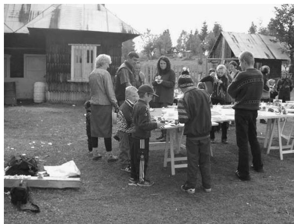
Fig. 9. Villagers at Ghetari (Apuseni Mountains, Romania) during a 'Planning for Real' meeting.

According to the degree of cooperation and communication, four levels of involvement were distinguished: informa-