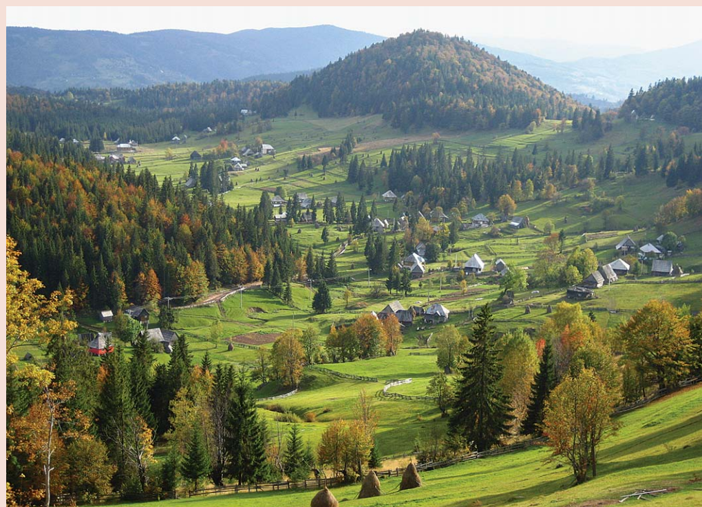
FIGURE 1 Landscape near Ocoale and Ghețari (1100–1300 m) in the Apuseni Mountains, characterized by dispersed settlements, grassland, and forest.

other activities including crafts, trade, and forestry, are their basic means of survival. Inhabitants have adapted their practices to the natural environment and have formed landscapes rich in structures, vegetation types, and species. The forests provide timber for construction and boards, firewood, wood pasture, berries, and mushrooms. The open land is dominated by meadows and pastures. Hay meadows are found on deeper soils. These are fertilized with manure and harvested manually using a scythe. Unfertilized grassland occupies the steeper and less fertile soils, mainly providing pasture.