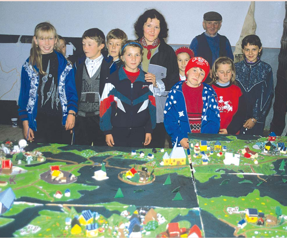
FIGURE 3 “Planning for Real:” Ghețari pupils display their 3-dimensional vision of their village in the future. This model served as a tool for further discussion with their parents and other stakeholders.

financial instruments, and better marketing strategies are implemented. Successful regional development will be the most convincing argument in the transfer of results to other rural mountain regions of Eastern Europe.